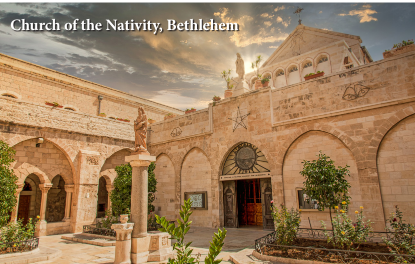
Church of the Nativity, Bethlehem

This morning, we will transfer to the airport to catch our return flight home. We hope you've enjoyed your journey with us and hope to see you again soon. Thanks for traveling with Nativity Pilgrimage!