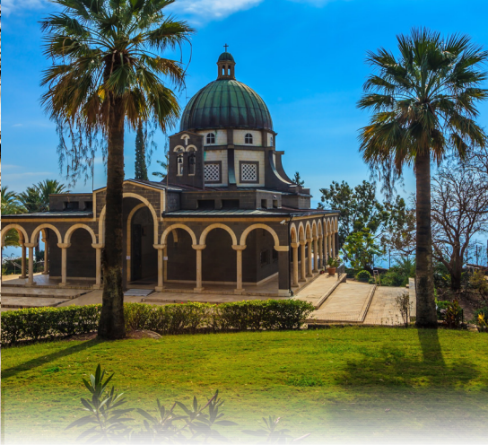
Mt. Of Beatitudes